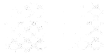
650w x 490d x 1200~1335h